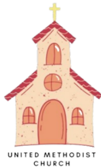
UNITED METHODIST CHURCH